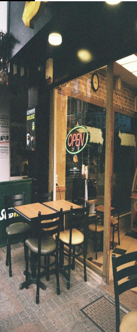
Impact of Scheduling Efficiency on Labor Costs, Service Quality, and Employee Satisfaction

This comprehensive graph visually represents the financial, service quality, and employee satisfaction impacts of different scheduling efficiencies, highlighting the benefits of optimal scheduling practices.